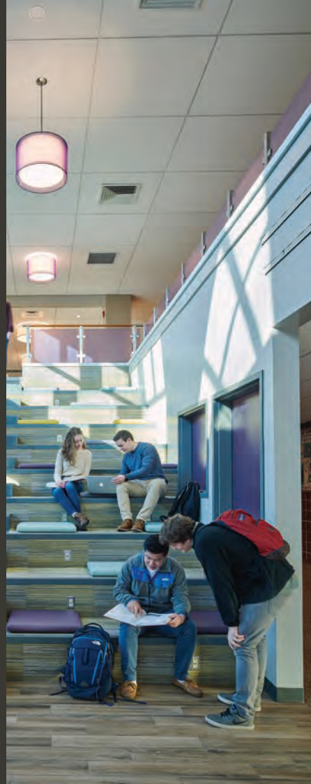
Ephrata Area High School Media Center, Ephrata, PA