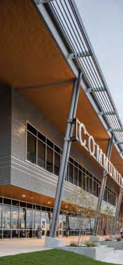
Community High School, Nevada TX | WRA Architects